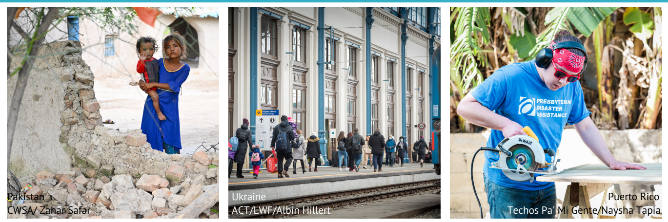
Matthew 25 continues to be a guiding force in the work of PDA.